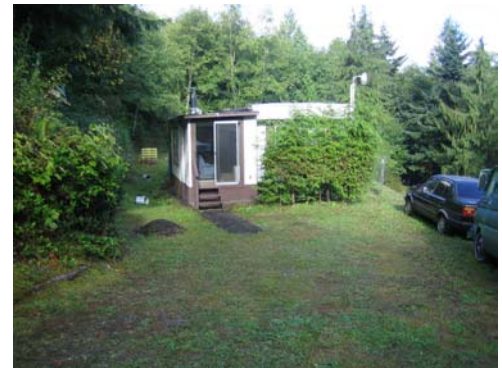
Cougar Ridge Hilton

We hope you have had a good 2006 and look forward to happiness and prosperity in 2007!!